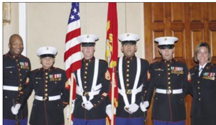
The United States Marine Color Guard